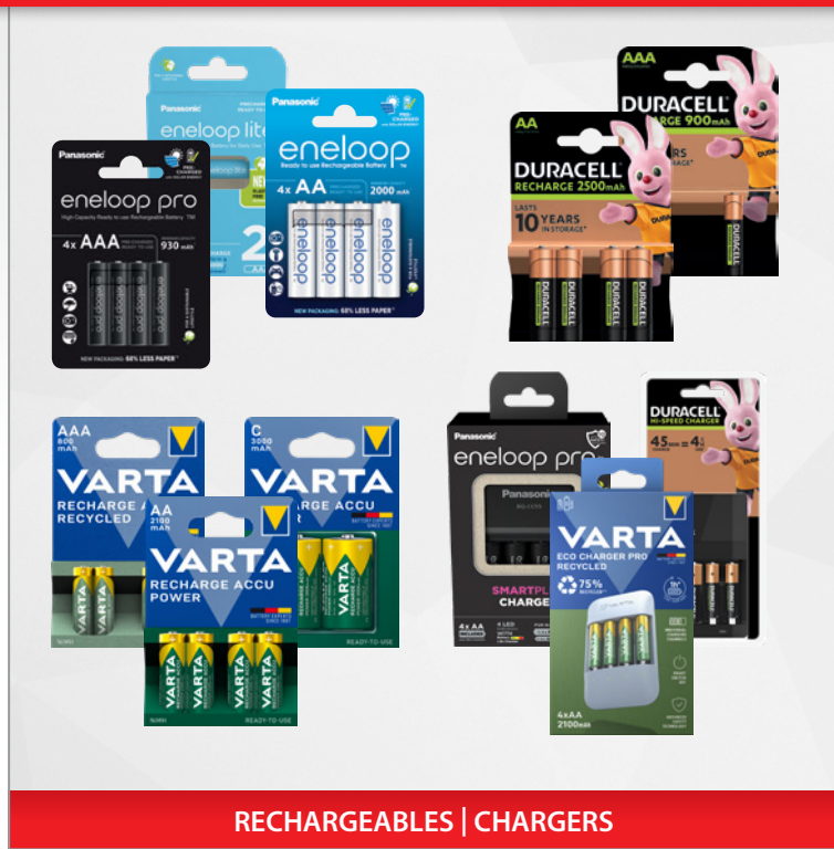
RECHARGEABLES | CHARGERS