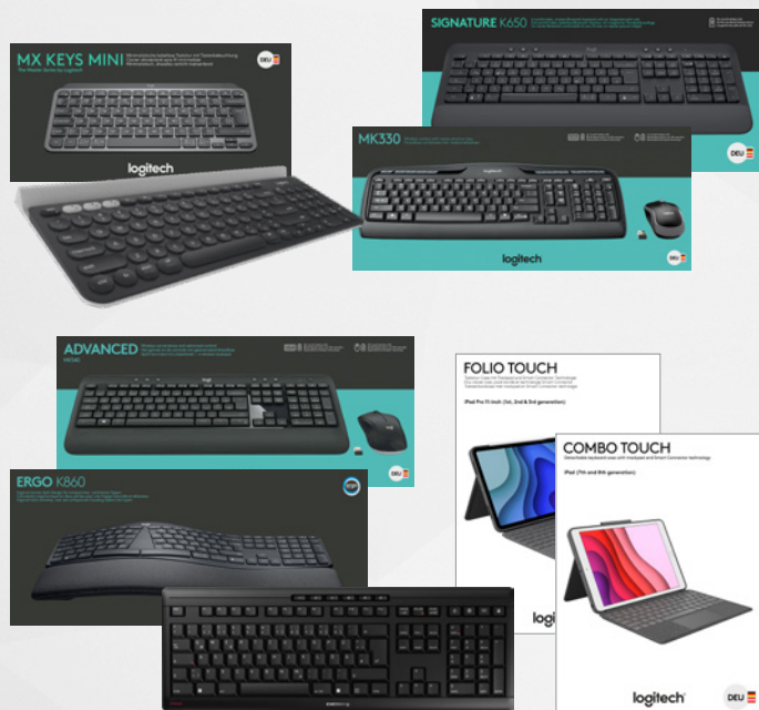
KEYBOARDS | COMBO SETS

We offer a wide selection of wired and wireless keyboards, folio keyboards for tablets, and combo sets (keyboard & mouse) in numerous sizes and with a wide variety of additional features.