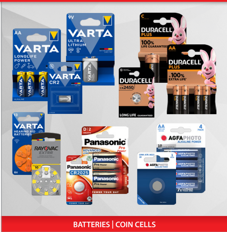
BATTERIES | COIN CELLS

Our energy product range includes a wide selection of different Batteries and Coin Cells from numerous well-known manufacturers.