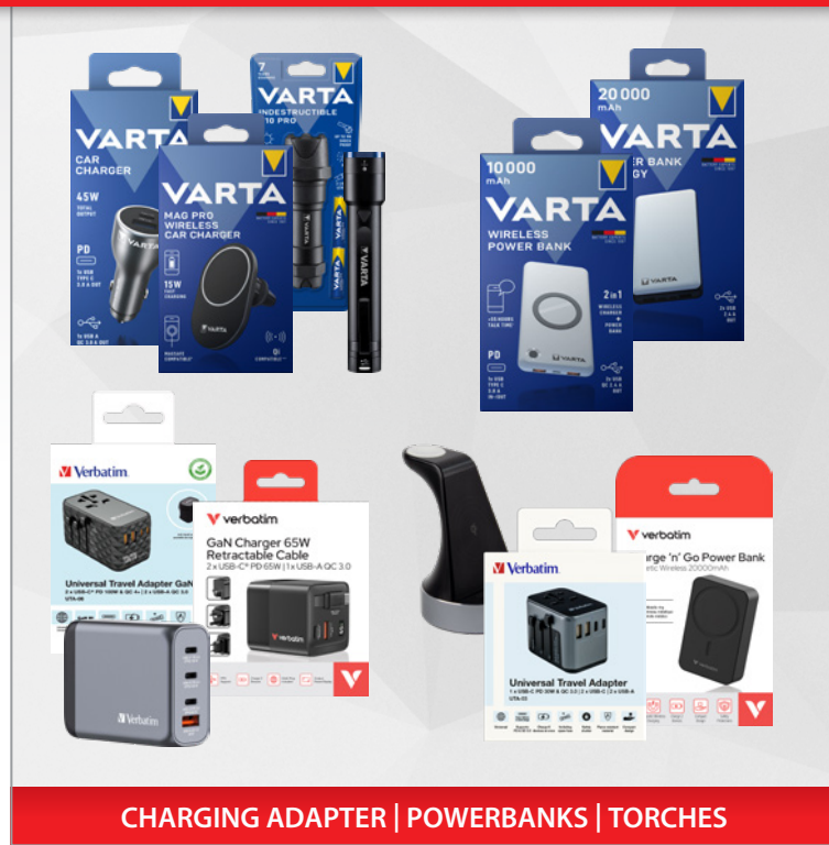
CHARGING ADAPTER | POWERBANKS | TORCHES

We offer a large selection of versatile charging adapters, high-performance power banks and reliable LED Torches.