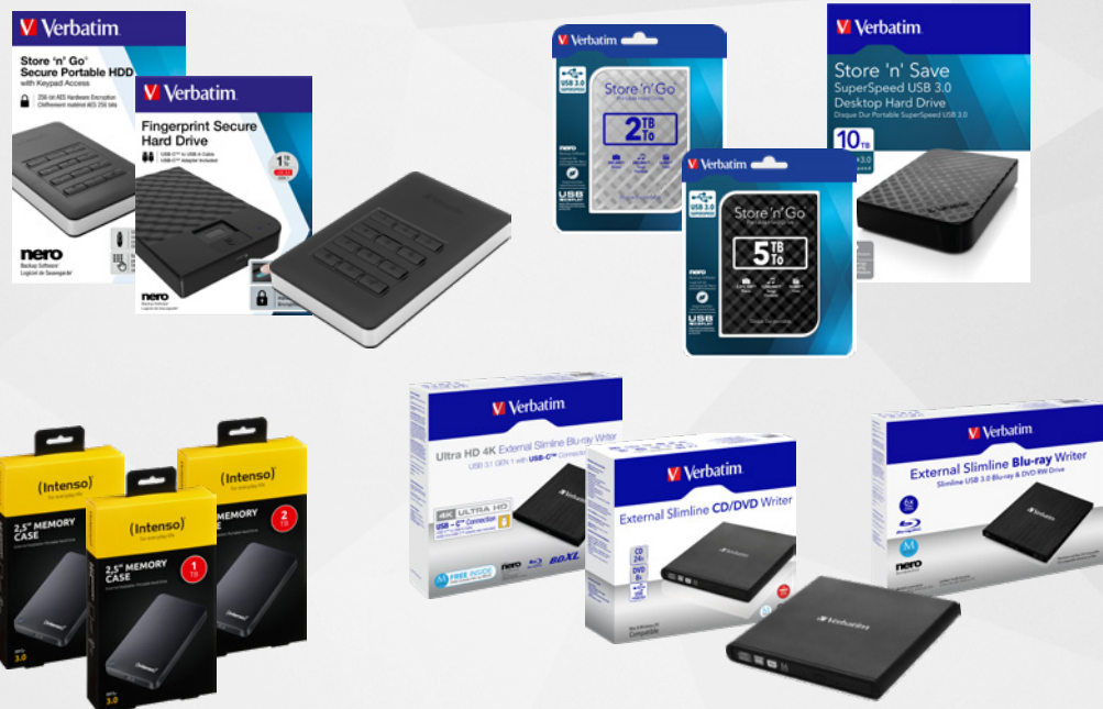
HARD DISK DRIVES | OPTICAL DISC DRIVES

We stock Hard Disk Drives in all common capacities, sizes and with all current interfaces. In addition, we offer various special Hard Disk Drives like security solutions. Our product range offers all common variants of internal and external Optical Drives (bulk & retail) as well as floppy disk drives.