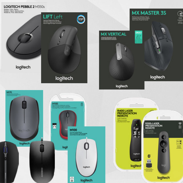
MICE | PRESENTERS

In the area of mice as well as presenters, Logitech offers a variety of innovations to make daily use as comfortable as possible – of course for both right- and left-handed users.