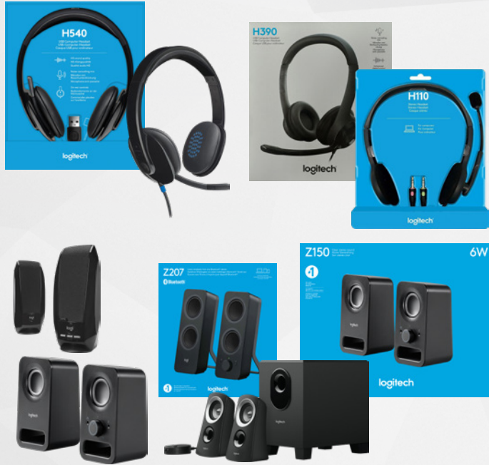
HEADSETS | SPEAKERS

As an ideal enhancement to the workplace, we carry numerous headsets and loudspeakers. Our range covers all application areas from occasional use to professional use.